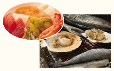
Kushiro Washo Market