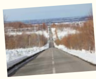
Road to Heaven