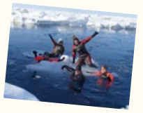
Drift Ice Walk