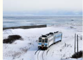
Ryuhyo Monogatari Train