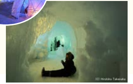
Shiretoko Drift Ice Festival