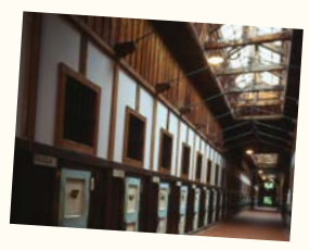
Abashiri Prison Museum